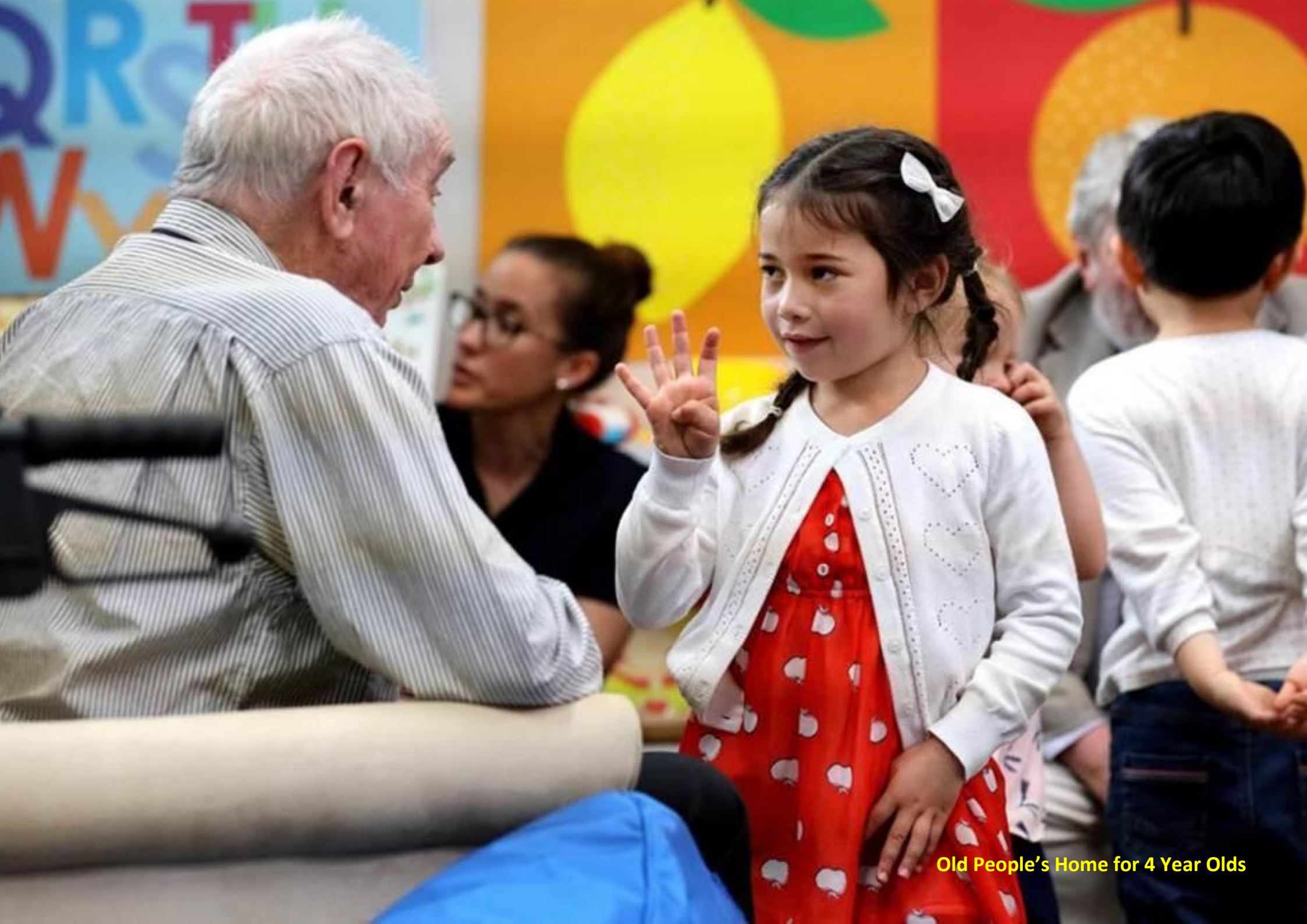
Old People's Home for 4 Year Olds