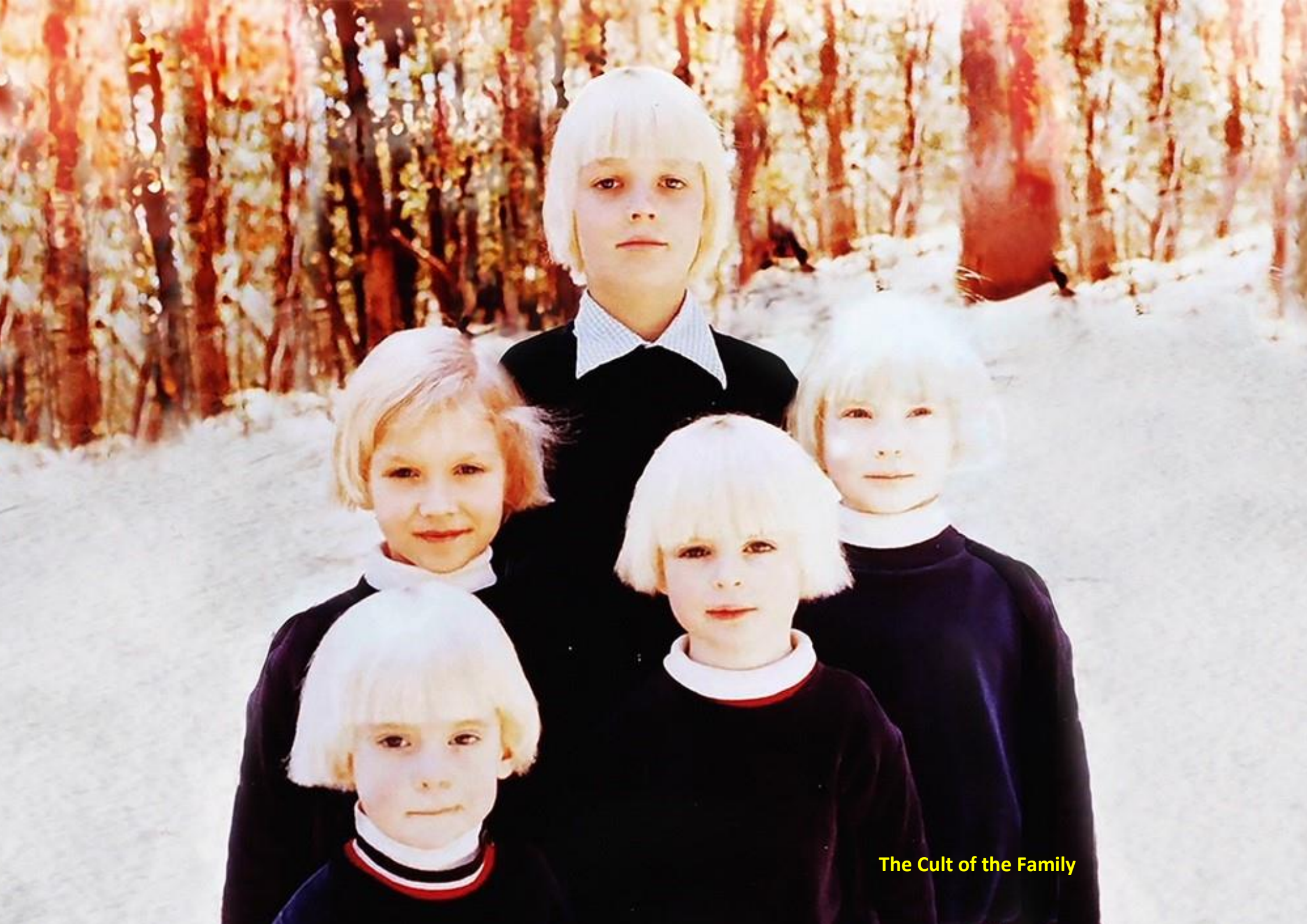
The Cult of the Family