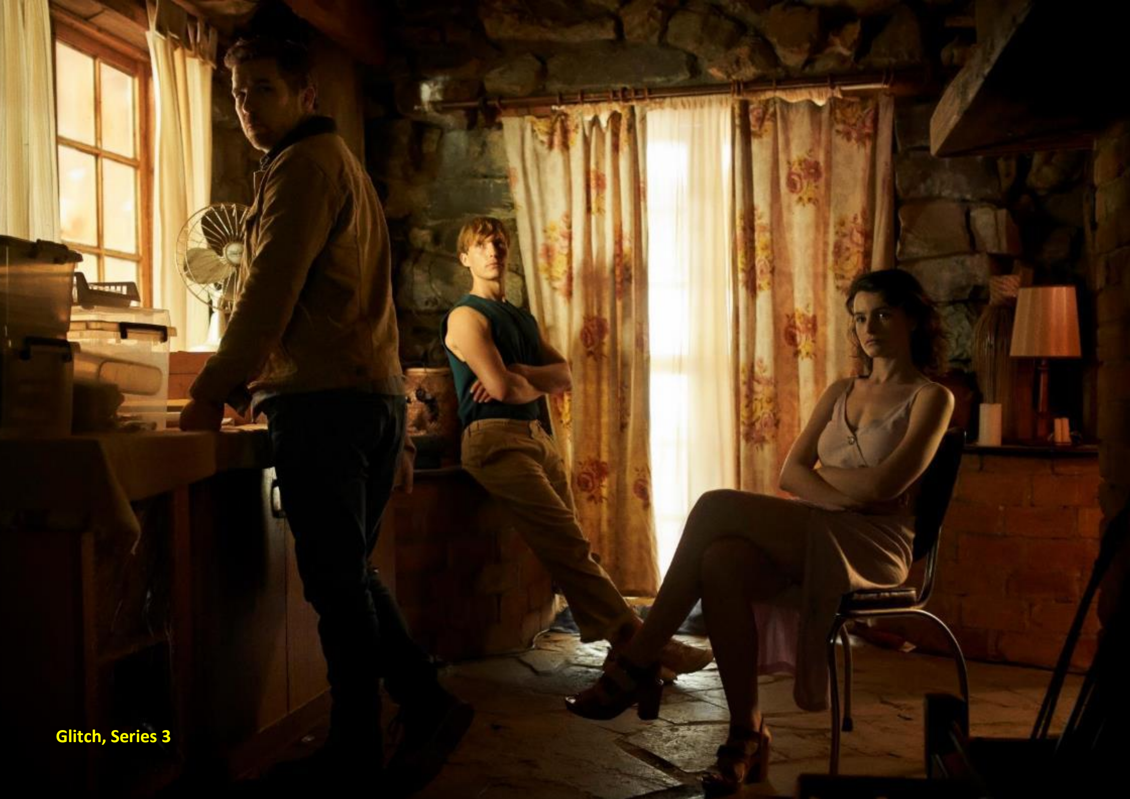
Glitch, Series 3