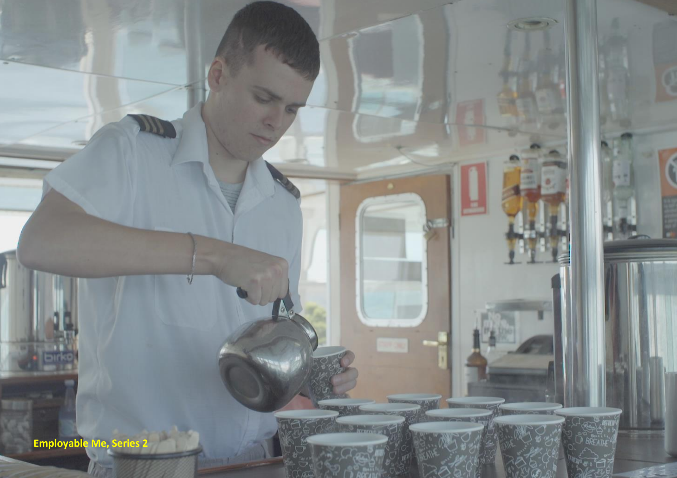
Employable Me, Series 2