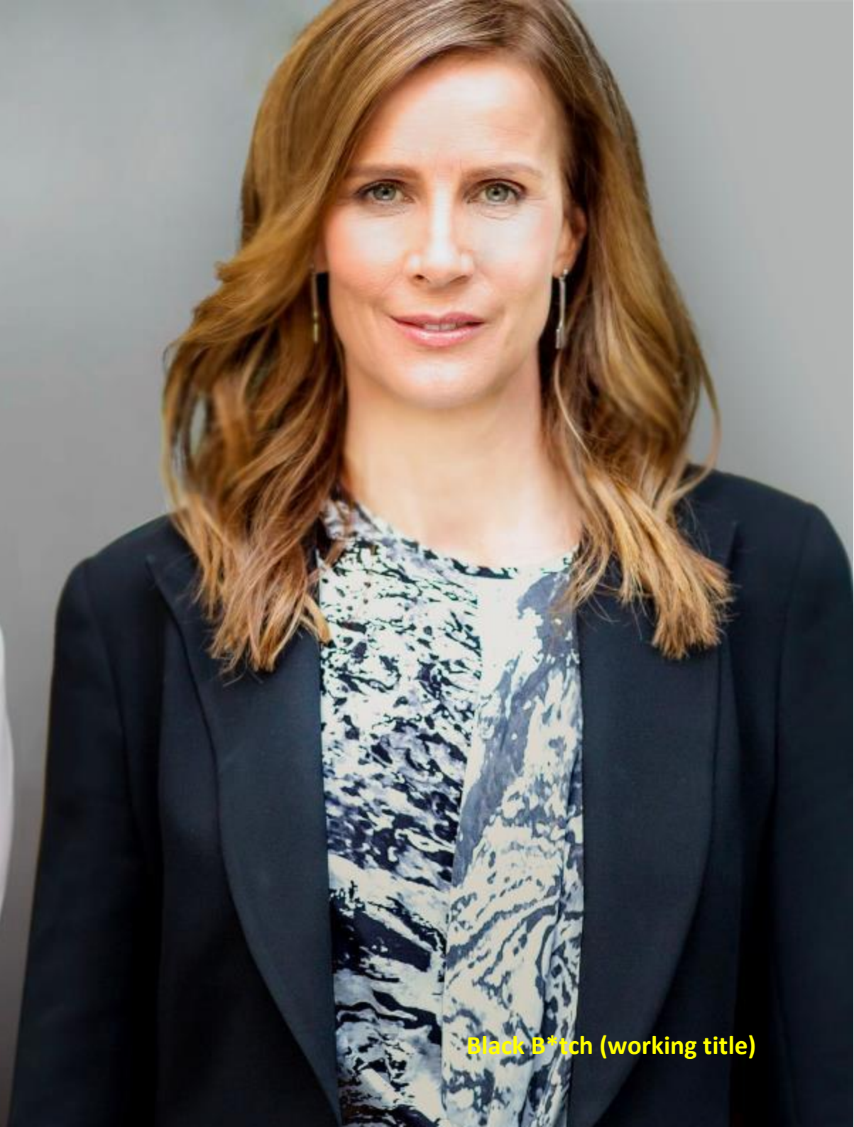
Black B*tch (working title)