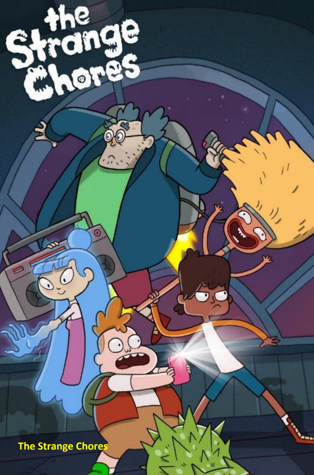
The Strange Chores