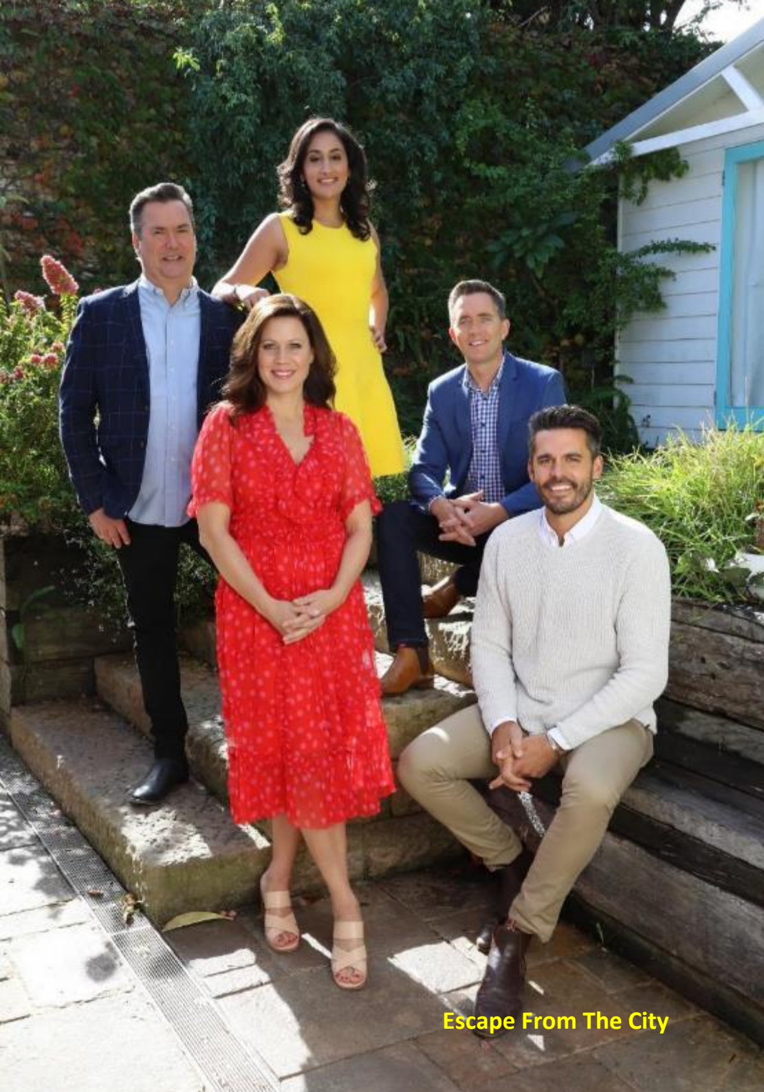
Escape From The City