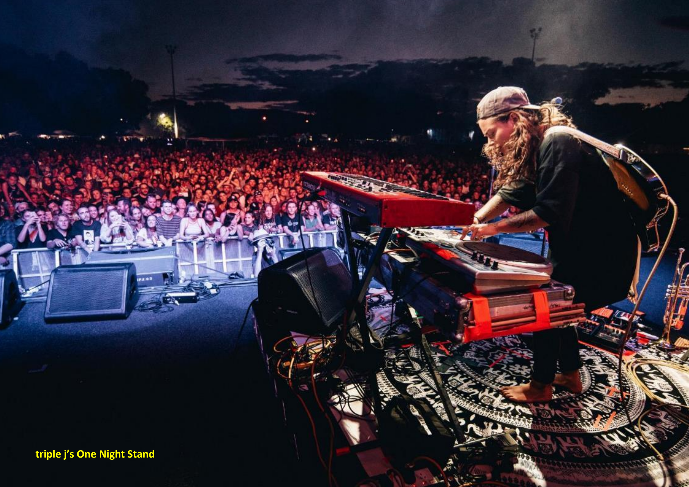
triple j's One Night Stand