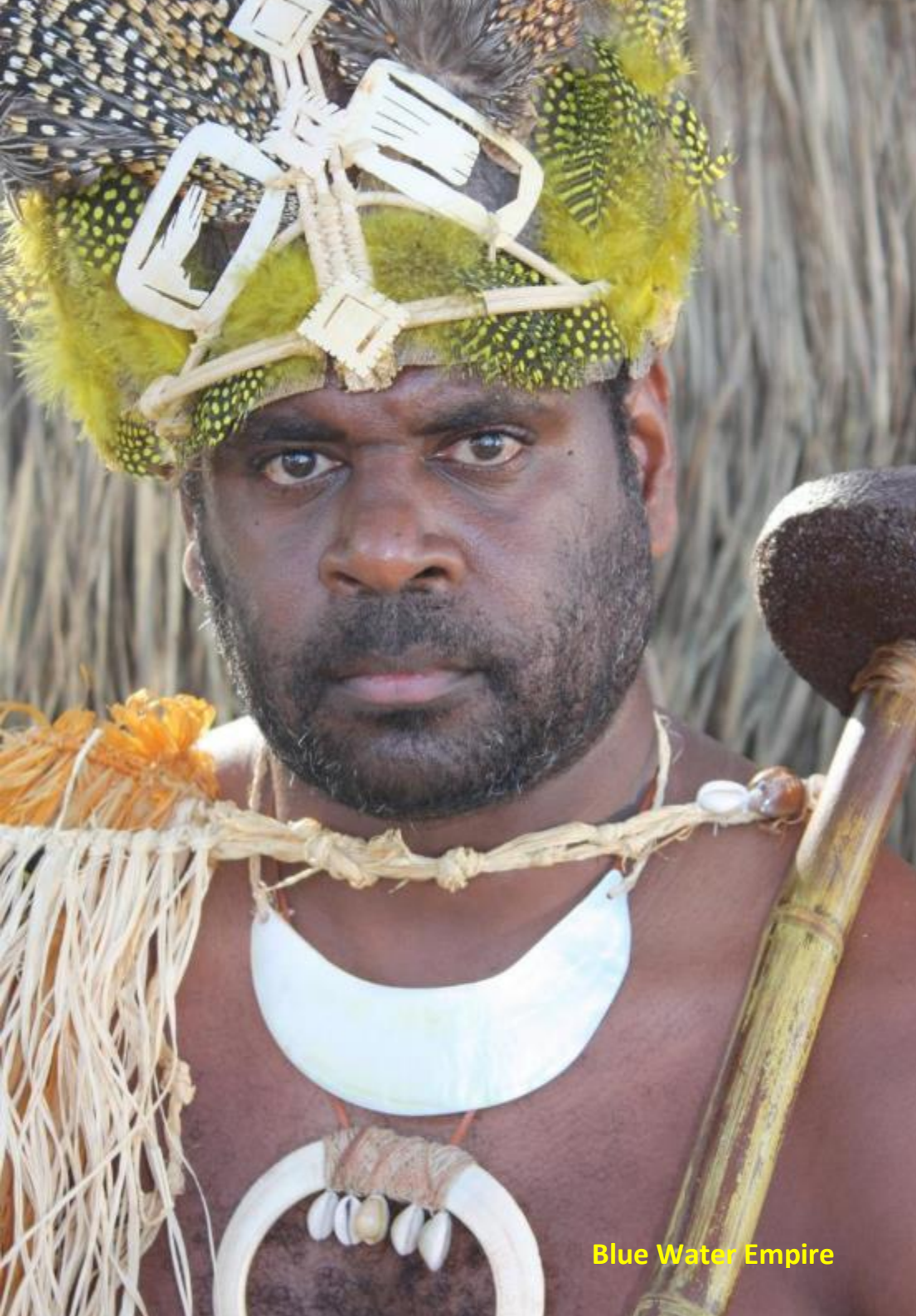
Blue Water Empire