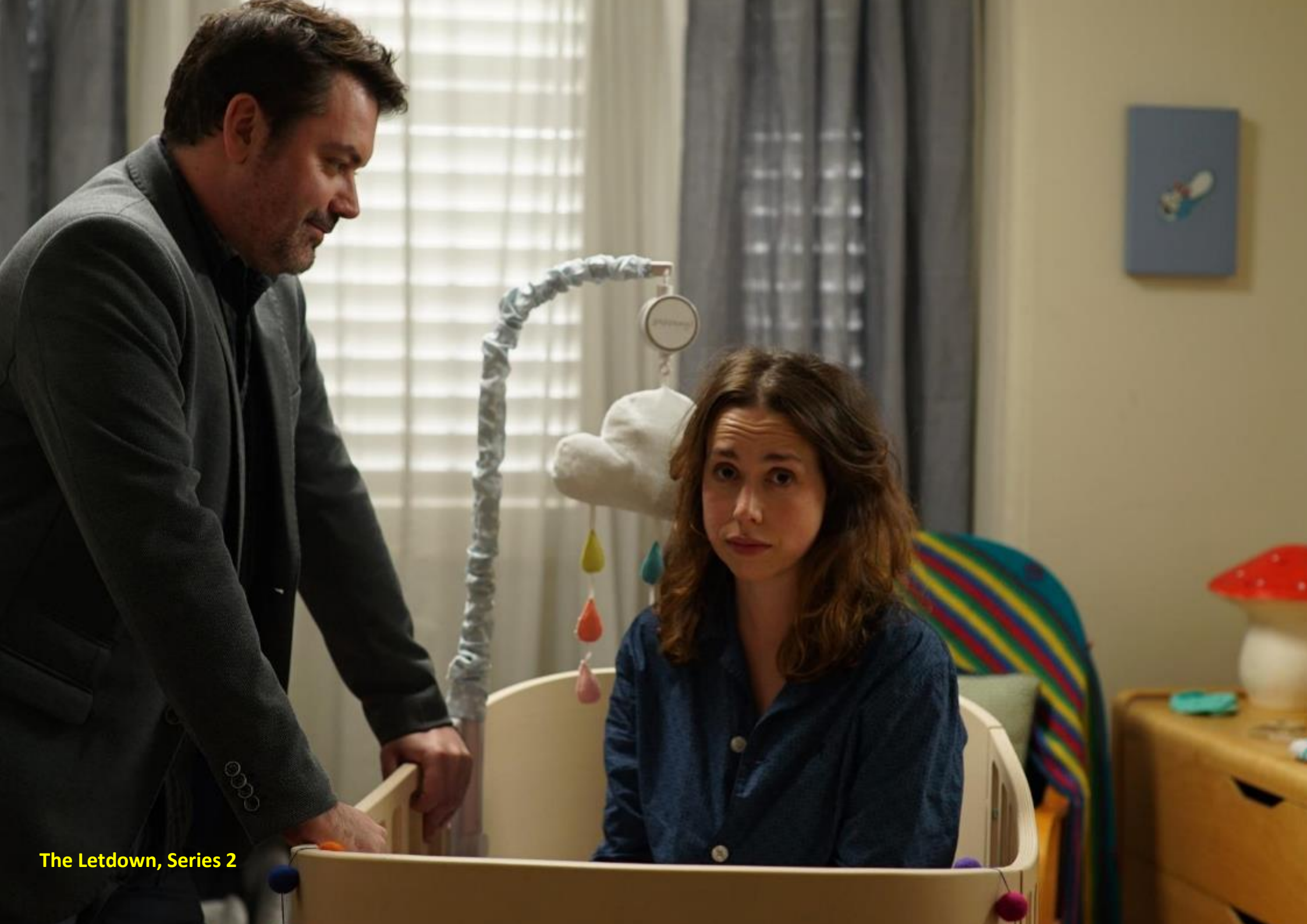
The Letdown, Series 2