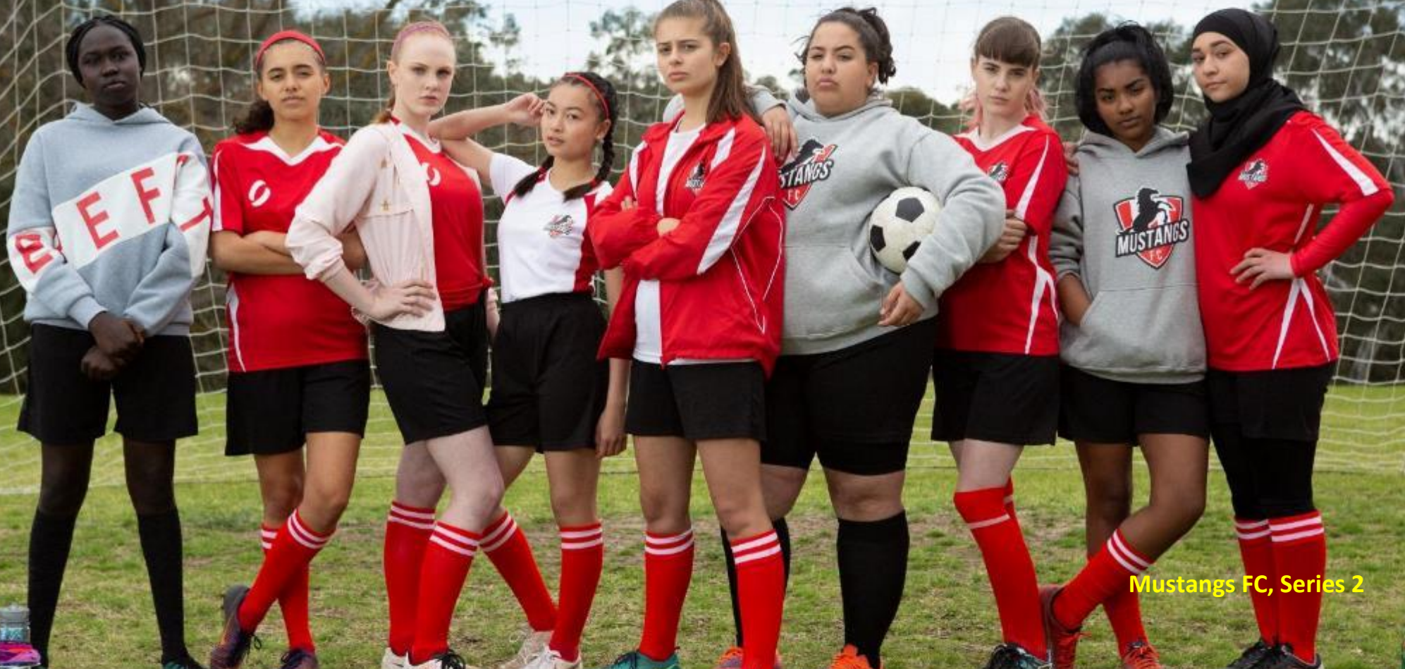
Mustangs FC, Series 2