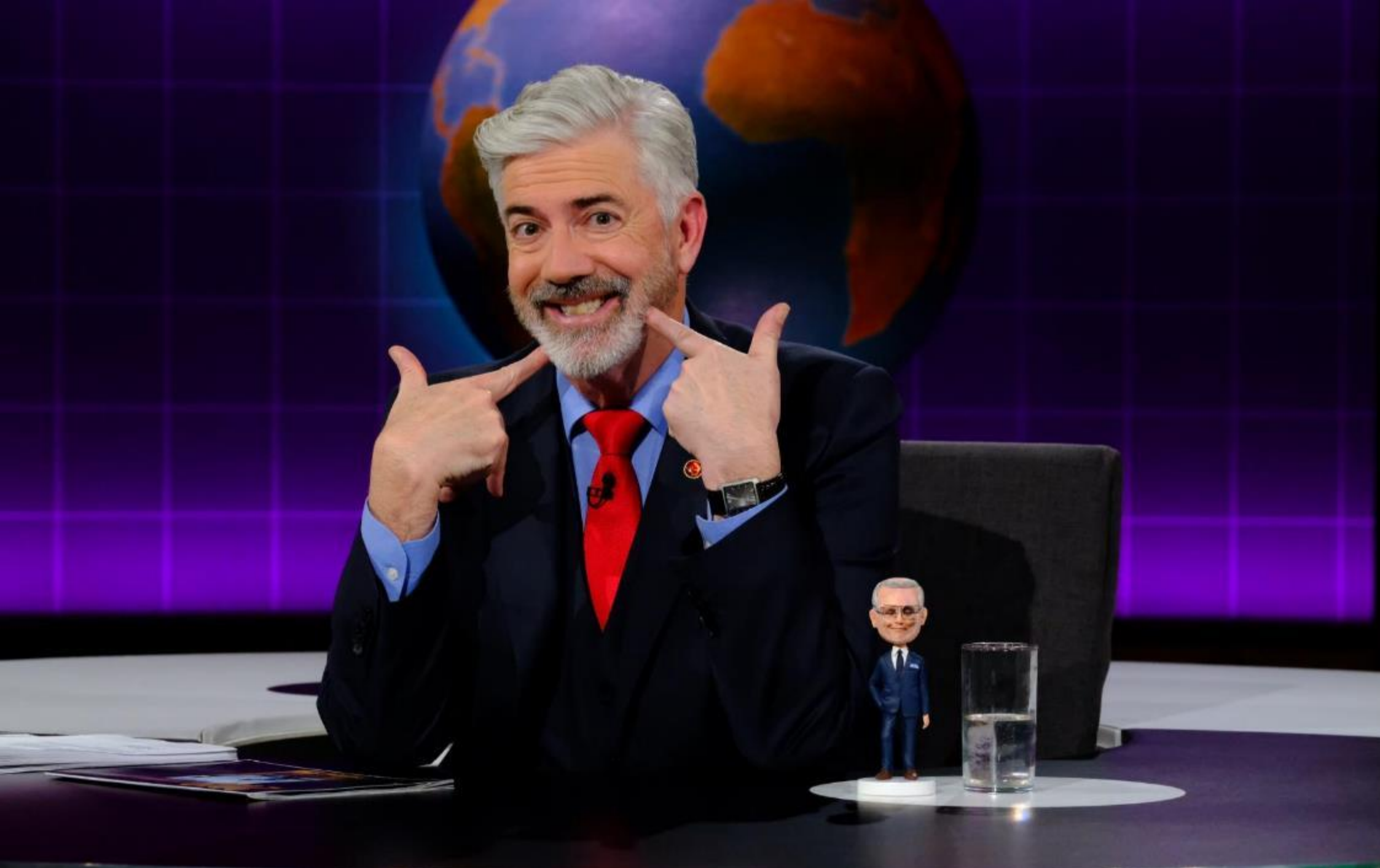
Shaun Micallef's Mad as Hell, Series 10